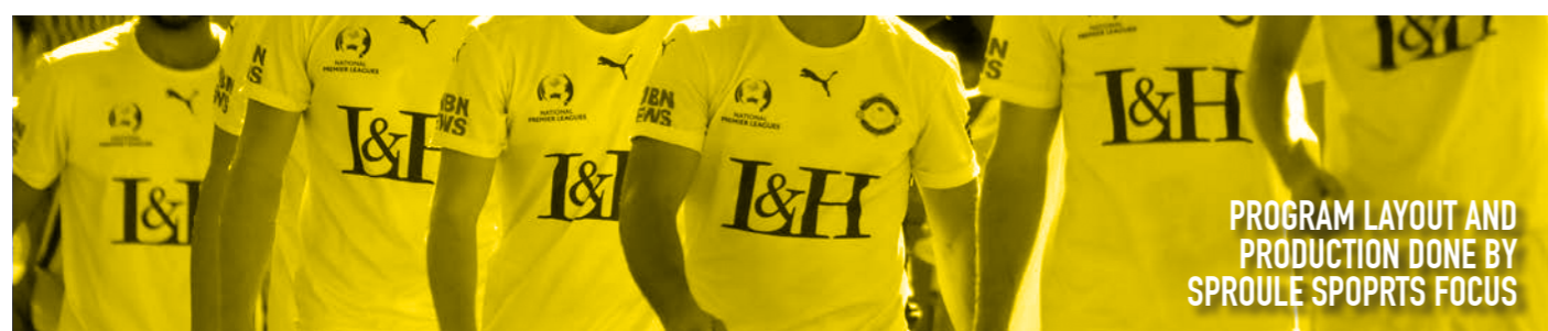
PROGRAM LAYOUT AND PRODUCTION DONE BY SPROULE SPORTS FOCUS